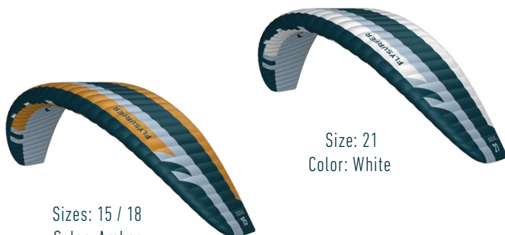
Sizes: 15 / 18 Color: Amber